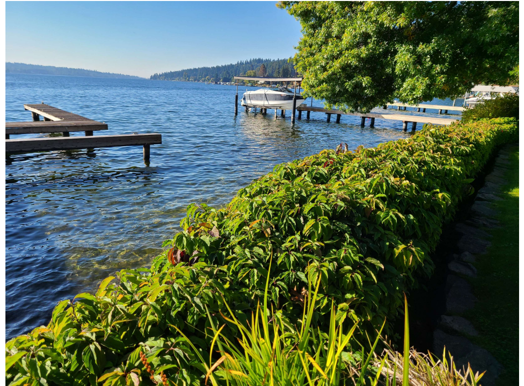
Figure 2: Red Twig Dogwood Shrubs Along Bulkhead