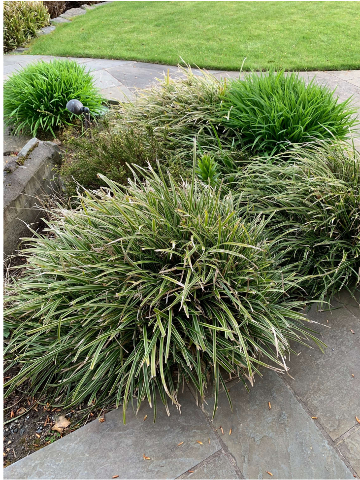
Figure 6: Big Blue Mondo Grass, Carex Grass, Yellow Heather and Lily