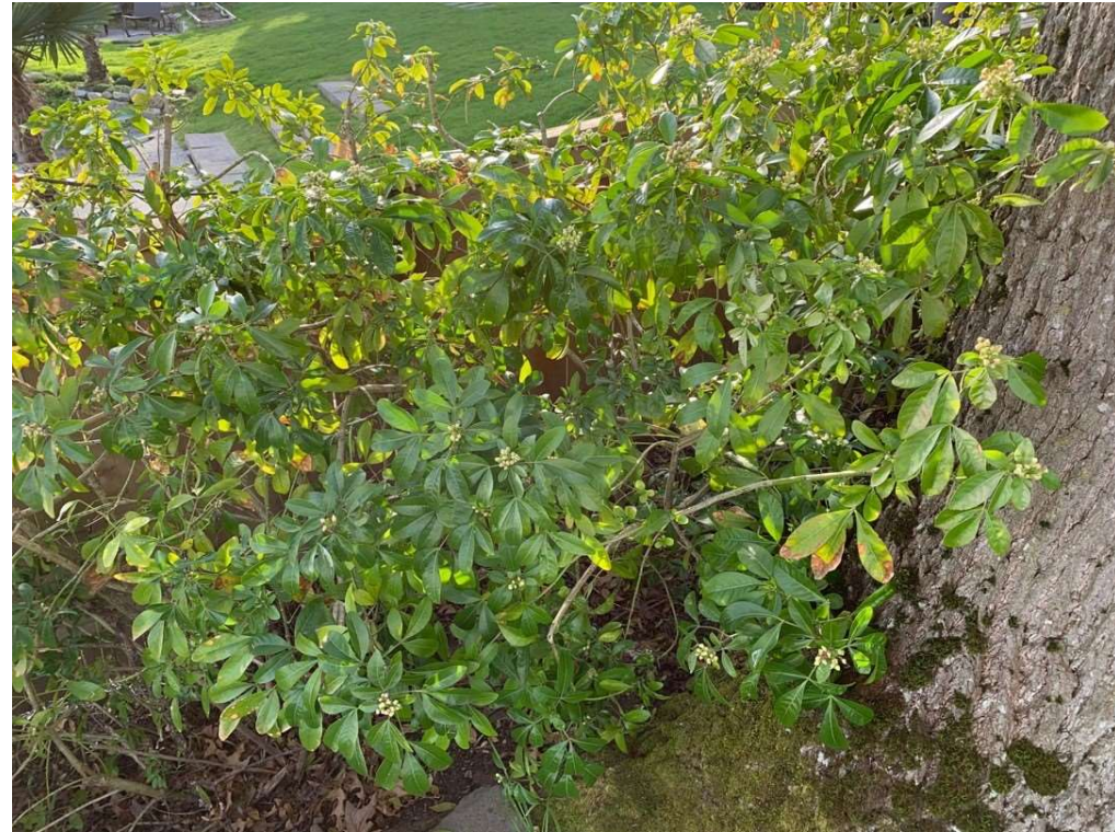
Figure 4: Mexican Orange Bush at base of oak tree