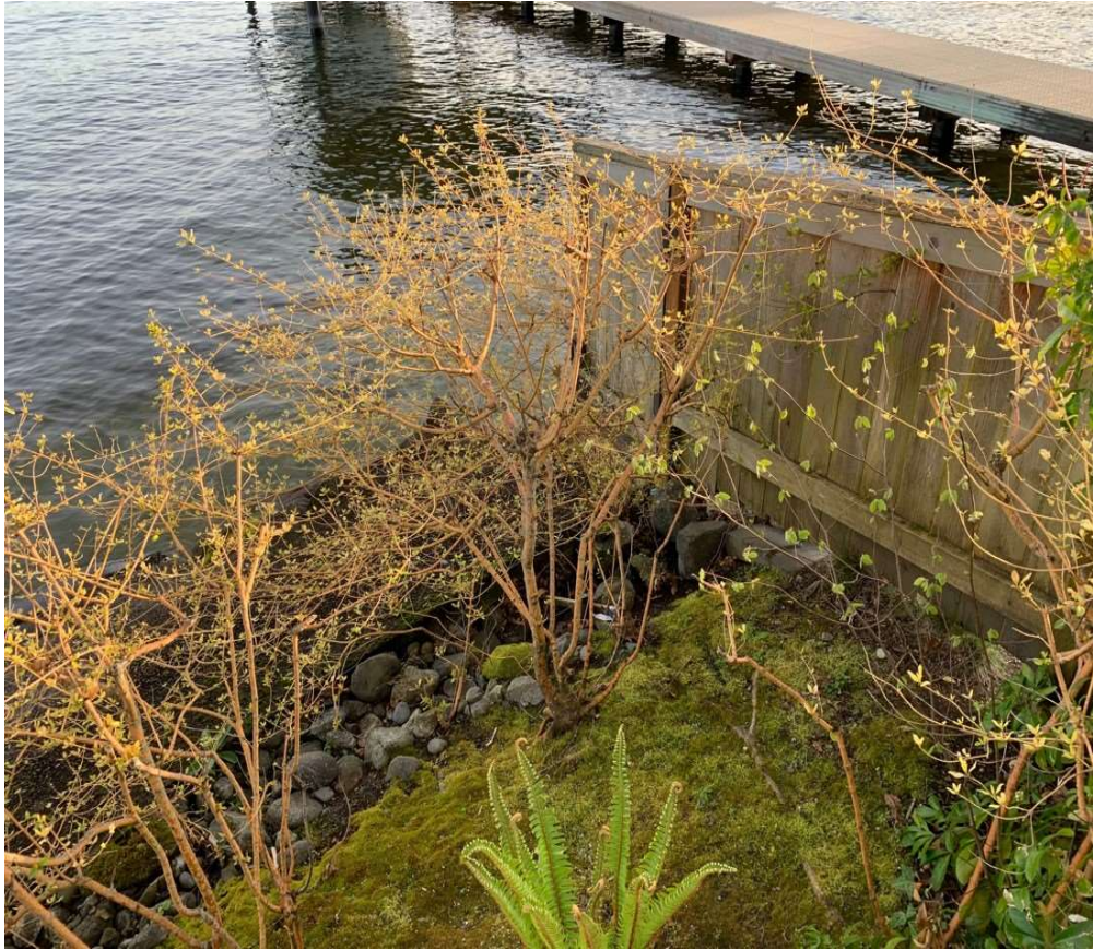
Figure 3: Yellow Dogwood and Ferns on Southwest corner by bulkhead (picture taken during winter)