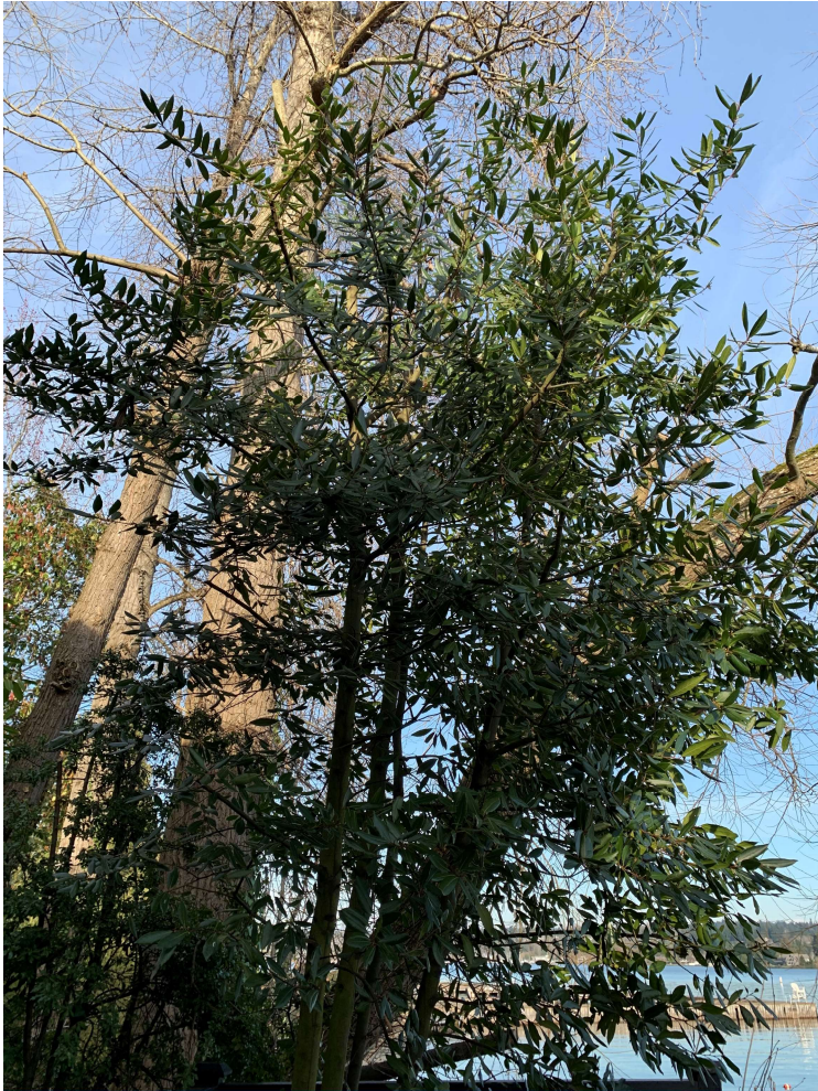
Figure 1: Bay Leaf Tree